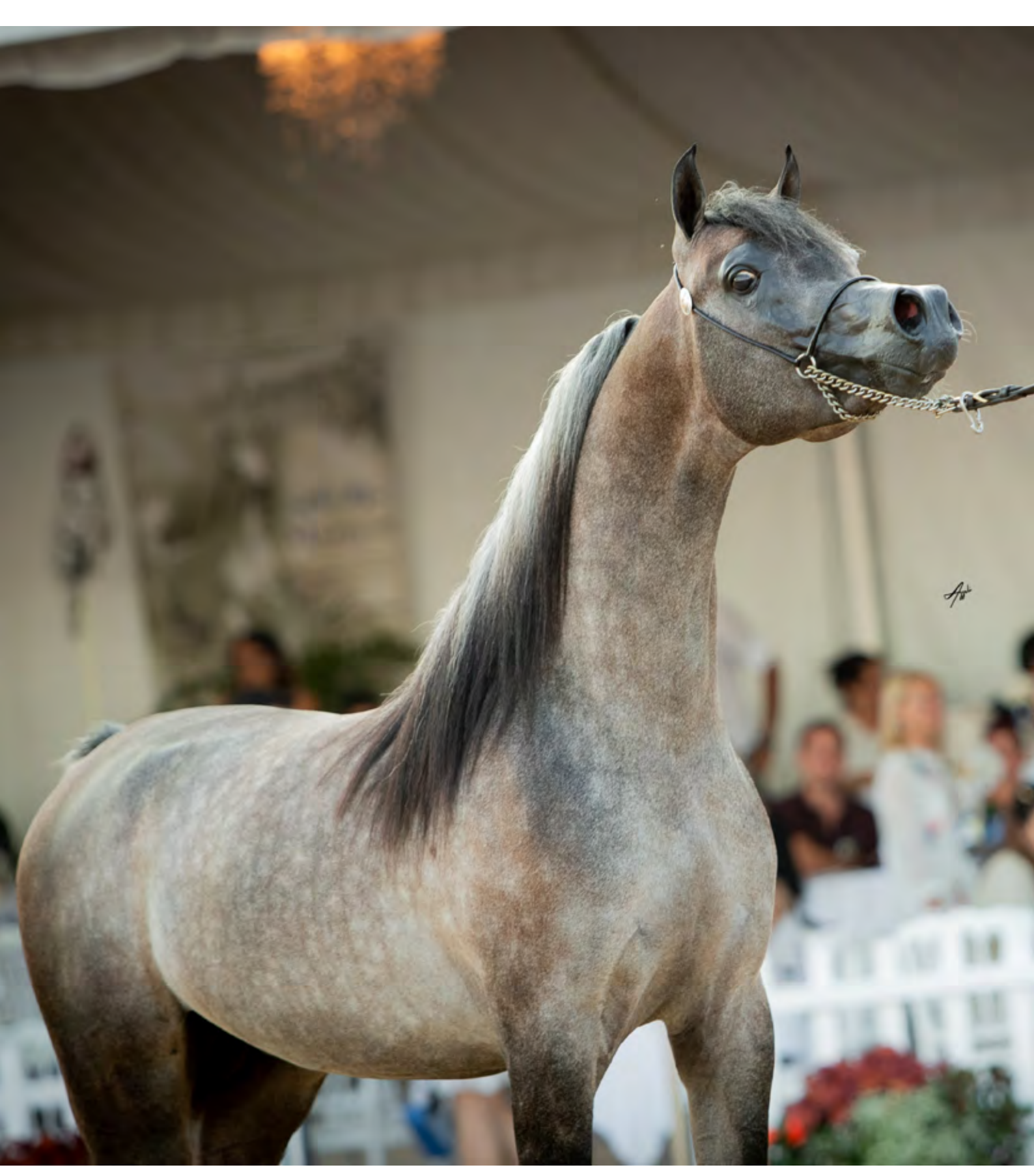
Menton 2019 - Alessio Azzali