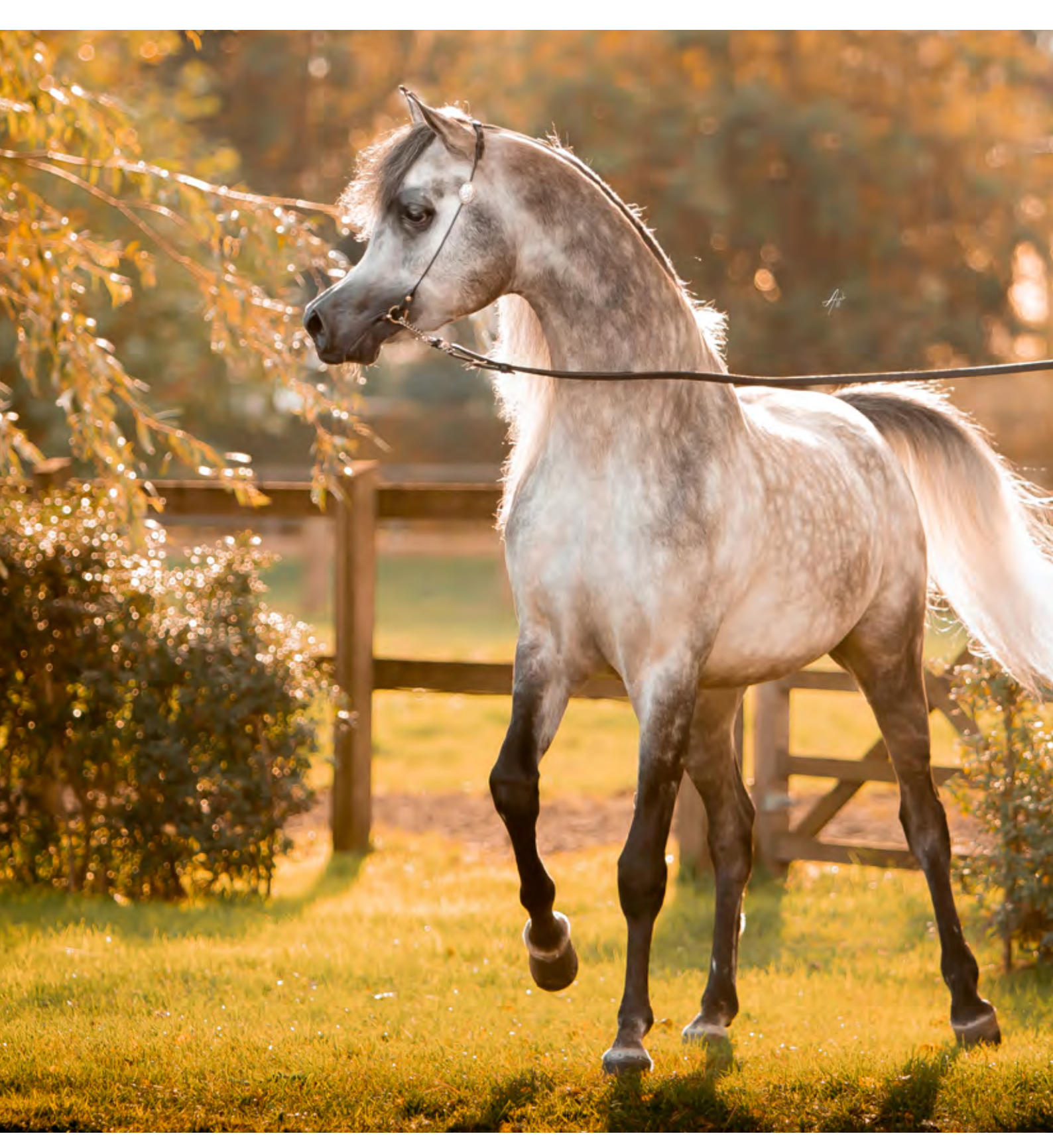
EKS Farajj - Alessio Azzali