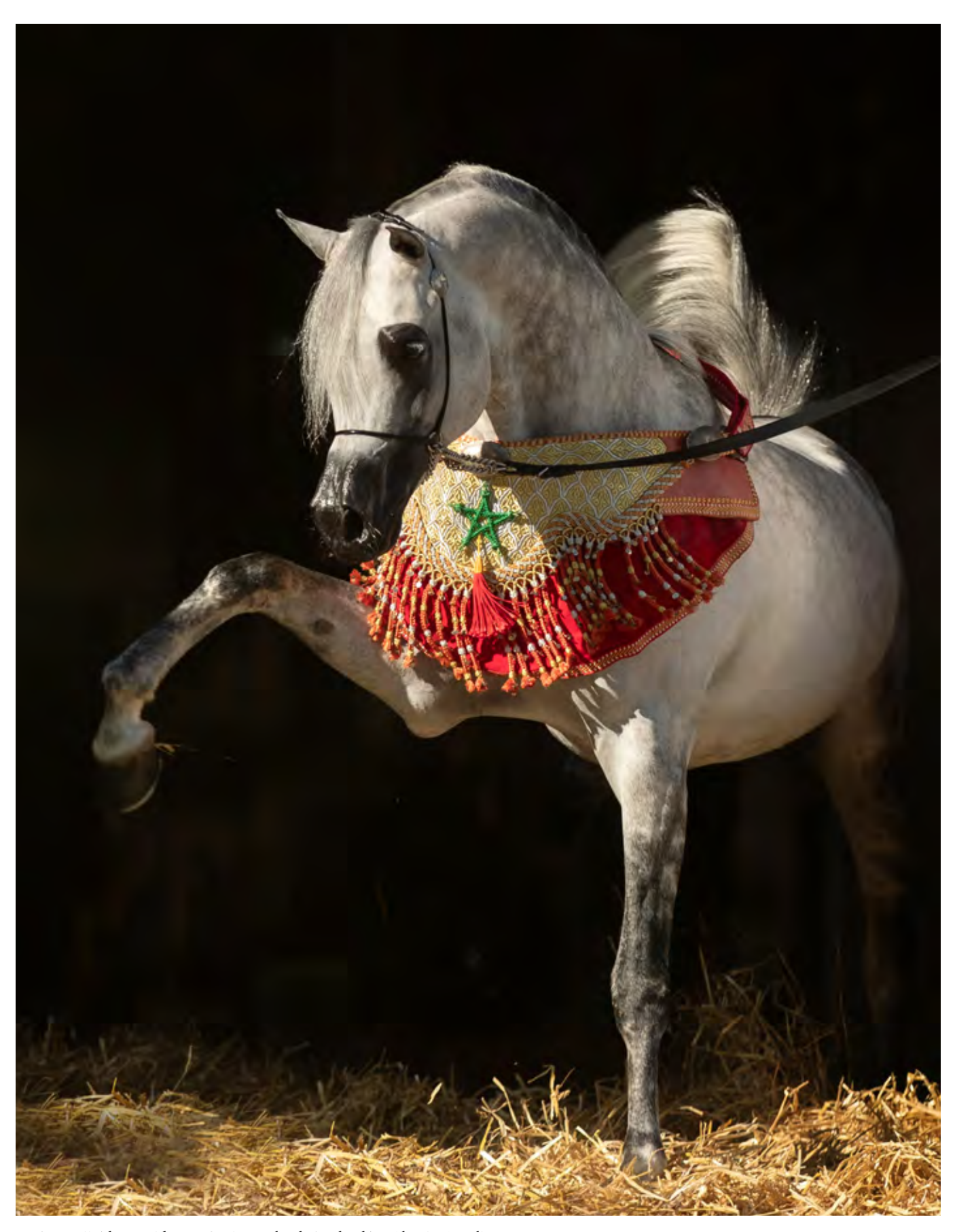
EKS Farajj (Ibn Farid x EKS Bint Helwah / Laheeb) - Alessio Azzali